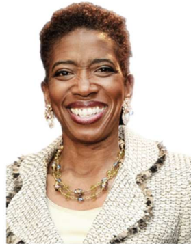
Carla Harris Leading Woman Award