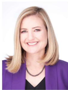
Kate Gallego Mayor of Phoenix